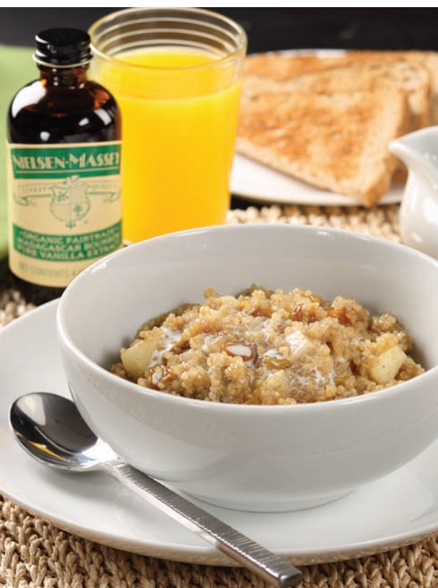
Breakfast Quinoa with Vanilla Cream, made using Organic Fairtrade Madagascar Bourbon Pure Vanilla Extract.

Catersource Conference & Tradeshow March 23-26 Las Vegas, NV